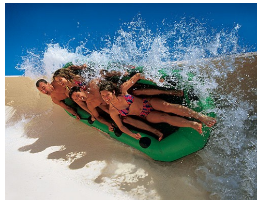
Wet n Wild Slides

for 14 consecutive days after you first use them.. You can hop in between those four parks in a day as long as you like and only have to pay for parking once per day. Also, you have free admission to the clubs at Universal's City Walk as well. This pass is perfect for those families down here for awhile and want to see it all. Transportation is not included in cost, please