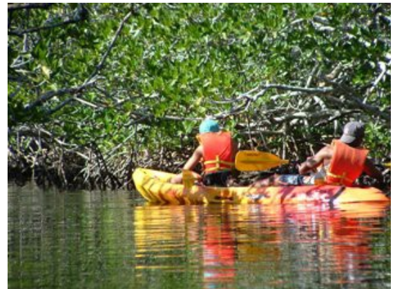
Kayaking the Florida Everglades