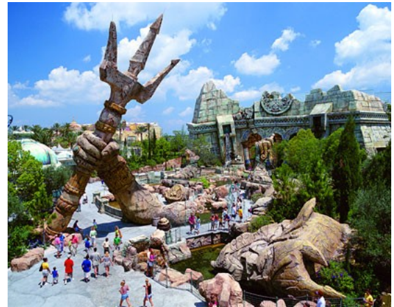
Universal's "Island of Adventure"

ORLANDO FLEX PASSES: The 6 Park Orlando Flex ticket gives you UNLIMITED admission to